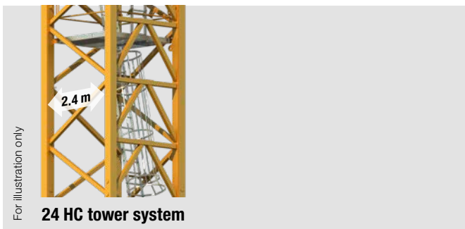
24 HC tower system

Re-reeving trolley available as an option